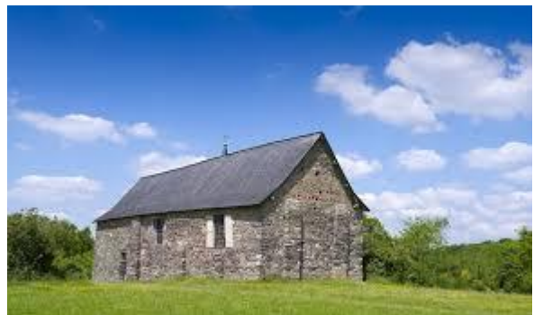
Prieure Saint Etienne